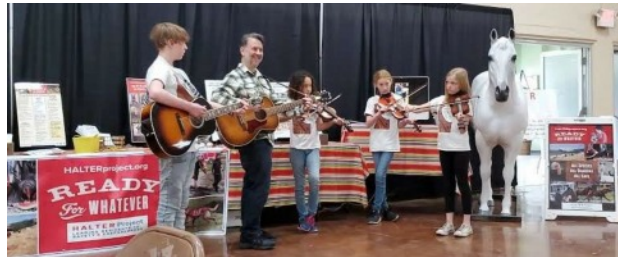
Halterproject & The Young Old-Timers